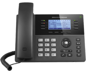
GXP1780 / 1782

8 lines, 4 SIP accounts, dual Gigabit ports (1782), PoE, 32 digital BLF/speed dial keys