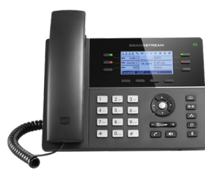
GXP1760 / 1760W

6 lines, 3 SIP accounts, PoE, 24 digital BLF/speed dial keys, WiFi (GXP1760W)